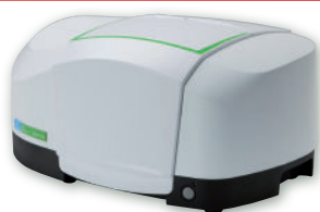
PerkinElmer Frontier and Spectrum Two FT-IR, NIR and FIR Spectroscopy