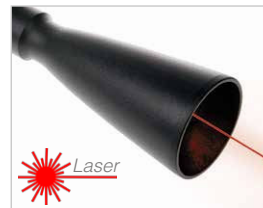
Long range module