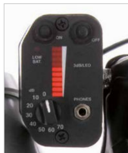
LED display and sensitivity dial