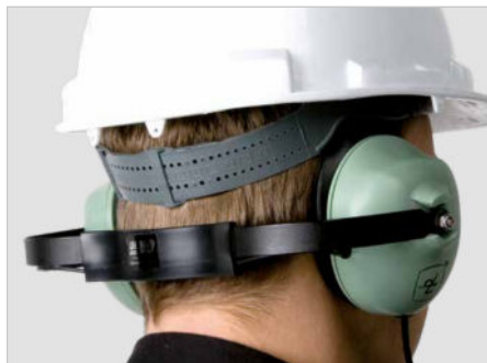
Headset for hardhat use