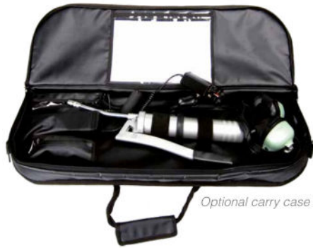
Optional carry case