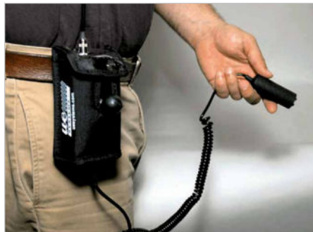
Holster for UP 201