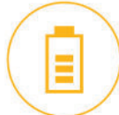
Long battery life